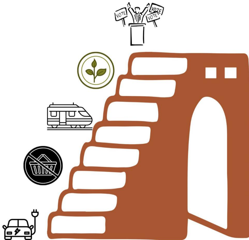
The conversion ladder

The presenter talked about the climate-goal that has been set for 2050 and her wish that this plan would make people gain consciousness about the climatic issue and would become motivated to make a change.