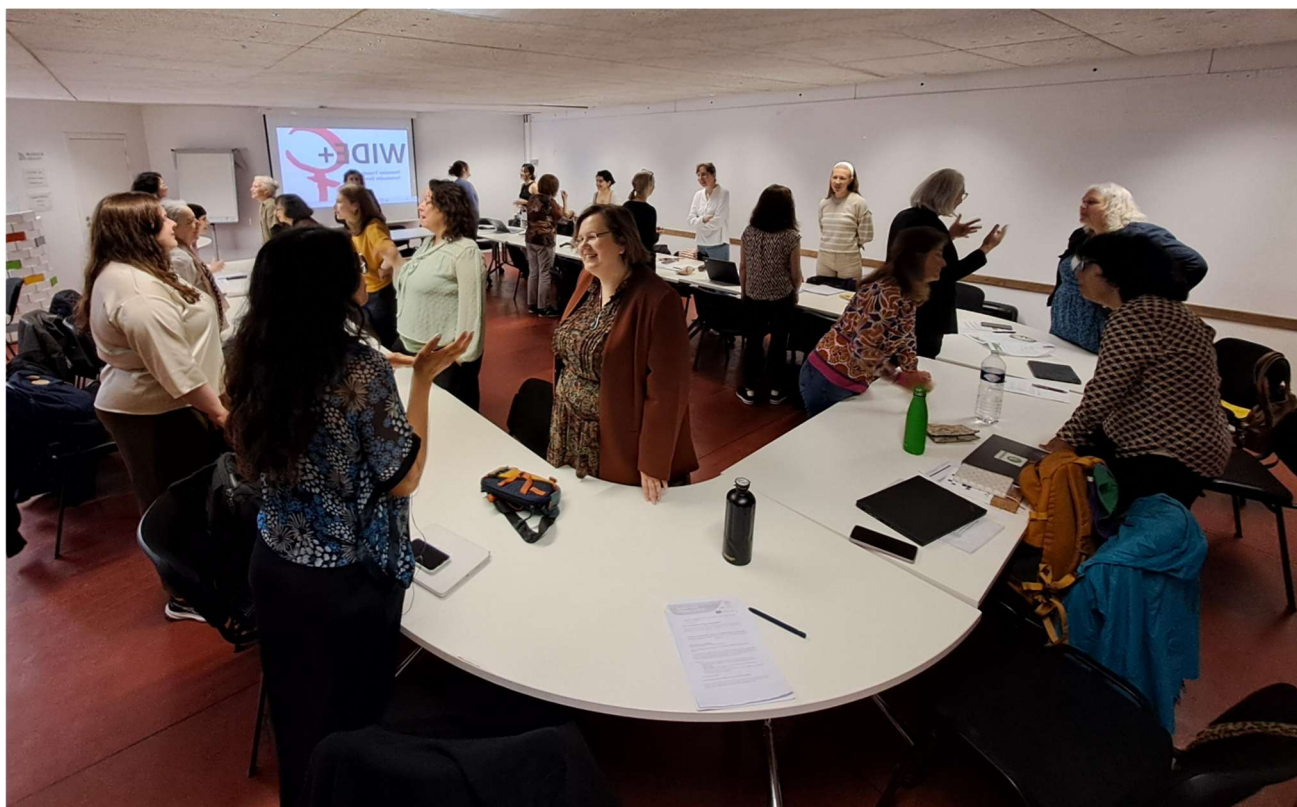
Participants got to know each other during one of the icebreakers