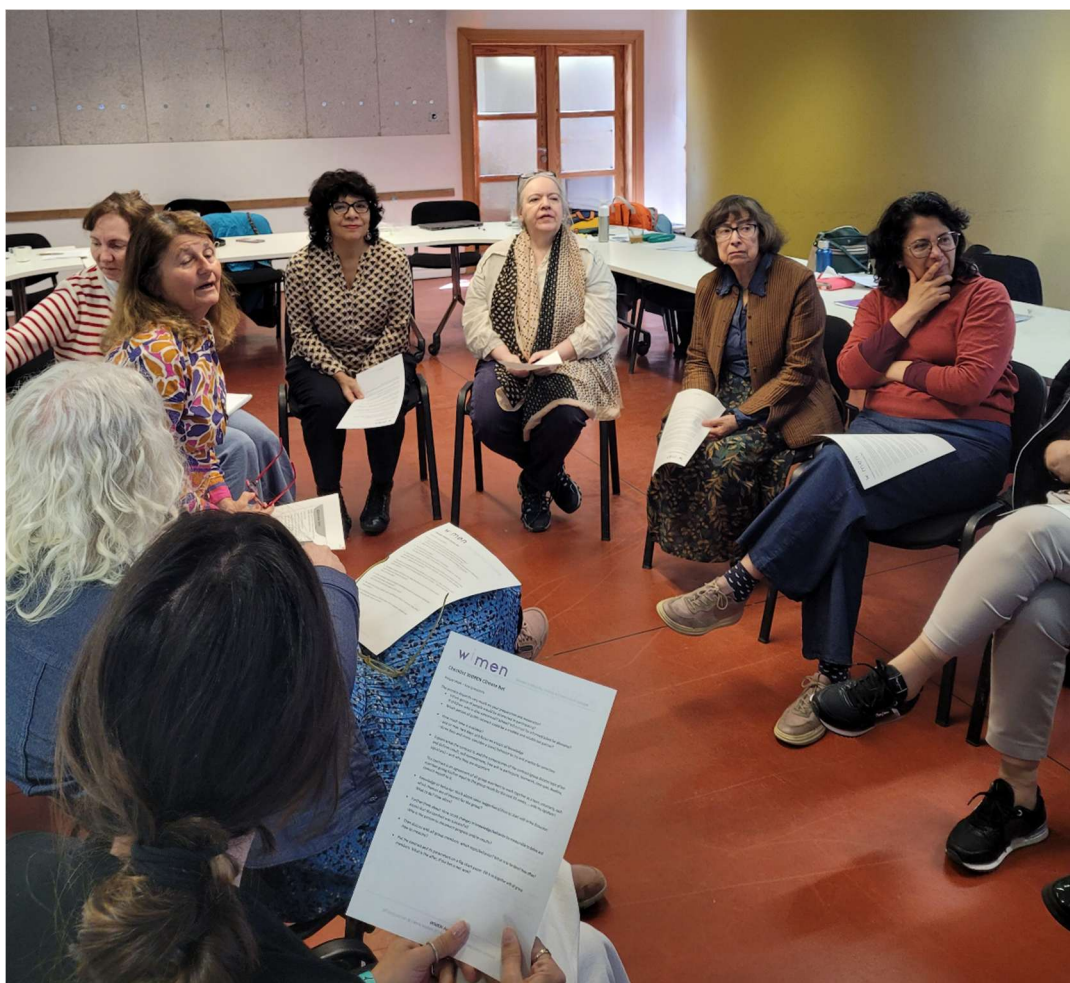
Participants during the workshop with the facilitator

The workshop focused on practising and reflecting on a certain case study of a bet. In the case study a group of 15-year-old girls from rural areas were brought together and introduced to the idea of exploring technical professions — fields traditionally underrepresented by women. Inspired by this, the girls made a symbolic bet: “9 out of 10 of us will succeed in life”. This positive and playful challenge became the heart of the Climate Bet case study. The participants received an explanation on how this case study worked in practice and had the chance to ask questions and give comments.