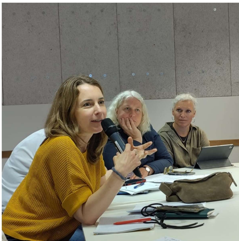
Participants contributing to the plenary debate

The discussion closed with a powerful reminder from Hadjimitova; She stated that collective action must span personal, local, and global levels. Only through strategic alliances and mutual support can feminist climate justice movements withstand political backlash and mobilize lasting change.