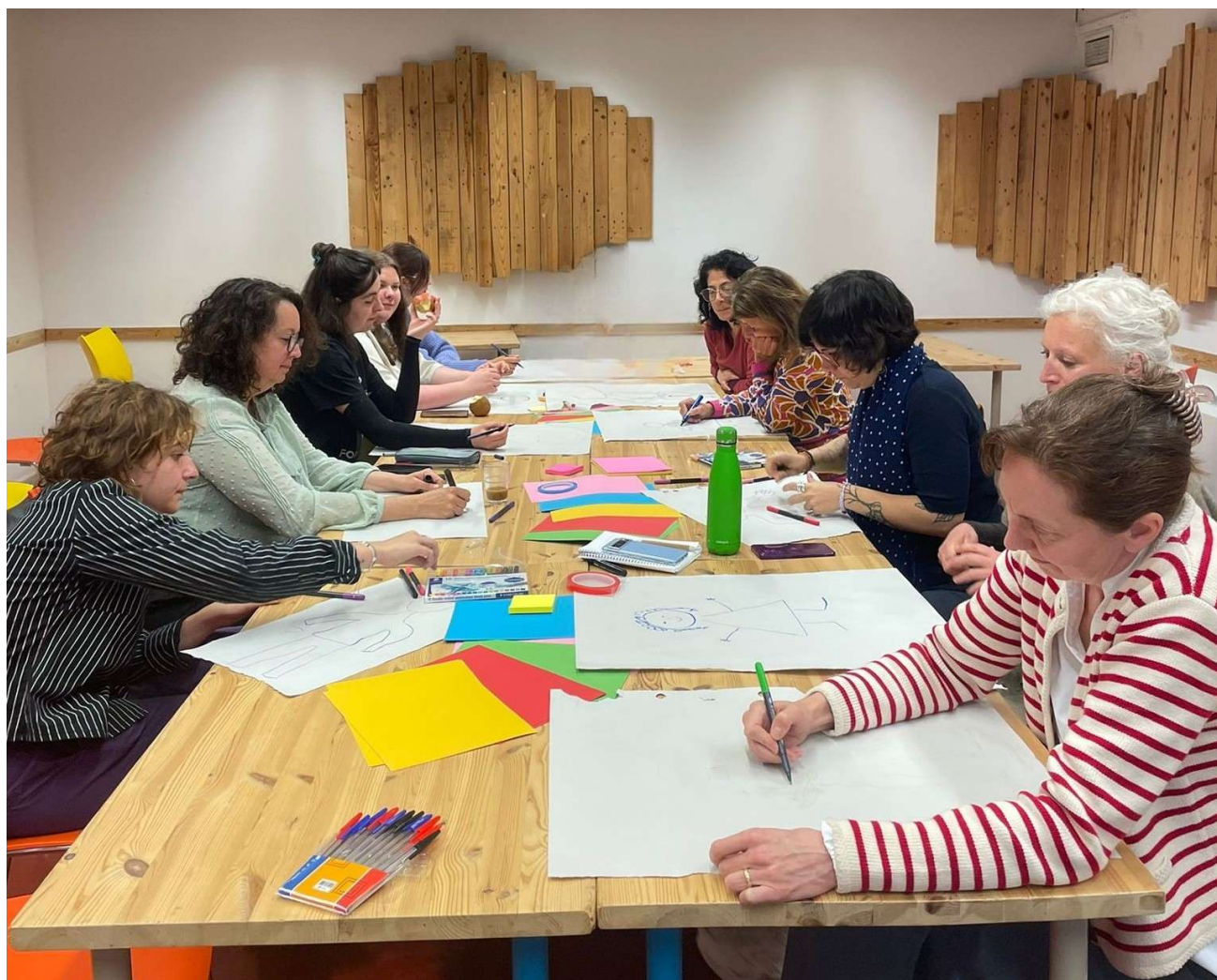
Participants working on their body map