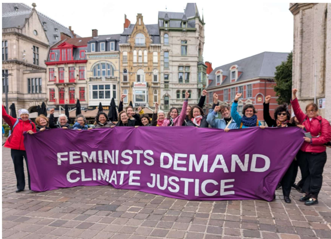
The COPGendered partners stayed on for another day in Belgium to learn about local feminist herstory (in Ghent, 7 June 2025) and did a small action of solidarity

Several participants thanked WIDE+ for the panel debate and highlighted how important sharing common knowledge is in these events. They all shared a common feeling of being determined and motivated to keep on supporting the gender equality and climate justice cause.