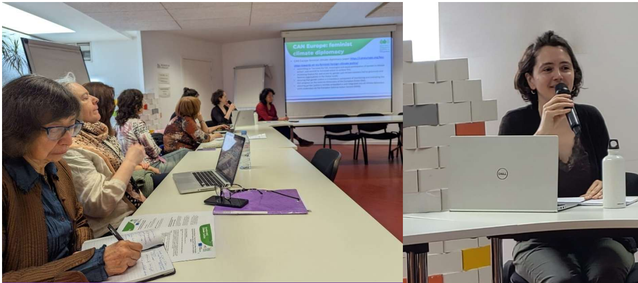
Participants listening to Rachel Simon

This has profound implications for feminist climate advocacy. Petromasculinity marginalizes care-based, equity-focused solutions, reinforcing extractive models that disproportionately harm women, racialized groups, and communities in the Global South. The climate crisis is being reframed not as a justice issue, but as a security risk, further sidelining intersectional approaches.