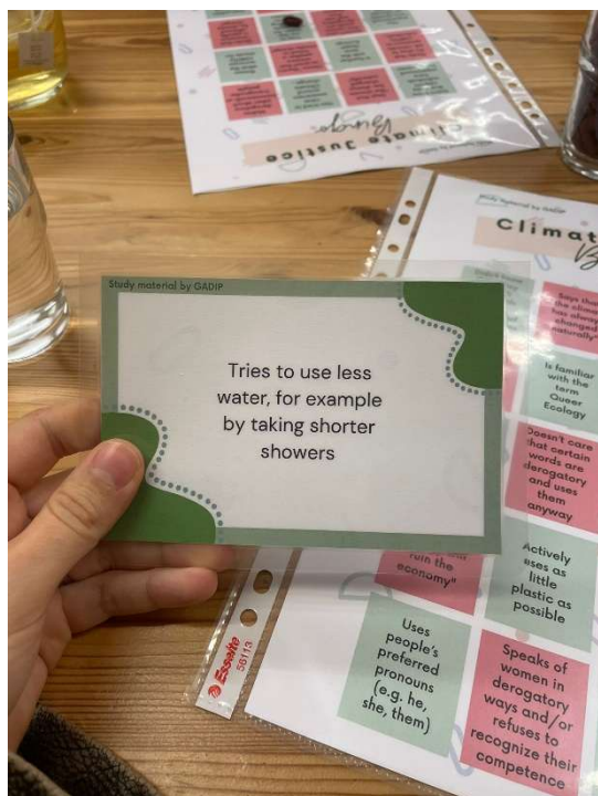
A green card in Climate Justice Bingo

Several thoughtful suggestions were shared on how to strengthen the activity further. One major recommendation was to shift the framing of questions to use “I” statements—for example, asking “Have I ever experienced this?” instead of “Have you met someone who has...?” This change would promote more direct self-reflection rather than distancing the topic.