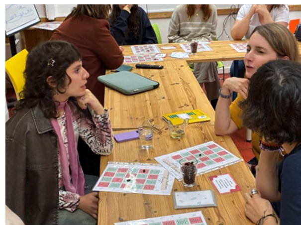
Small group discussion in Bingo

The goal of the game is to create a line of four or five marked spaces, thus achieving “bingo.” The underlying goal of the method is to encourage rich conversations, in which participants can share their thoughts, stories, and critical reflections on how different communities and individuals navigate climate justice, identity, and activism.