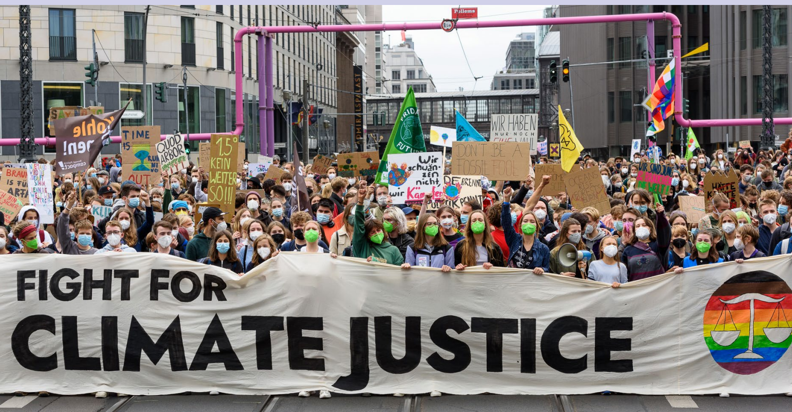
Fridays for Future protest in Berlin 2021

There is a lot of resilience and knowledge within different LGBTIQ communities. Many activists as well as grassroots collectives — like Queers x Climate and Out for Sustainability — gather and spread information about the environmental impacts on LGBTIQ individuals. For example, Queers x Climate is an international queer-led initiative dedicated to promoting climate activism in the LGBTIQ community and beyond. They bring together queer-led groups that are setting up or participating in climate justice marches. Recently, Out for Sustainability became the first LGBTIQ organisation to receive observer status by the UNFCCC.