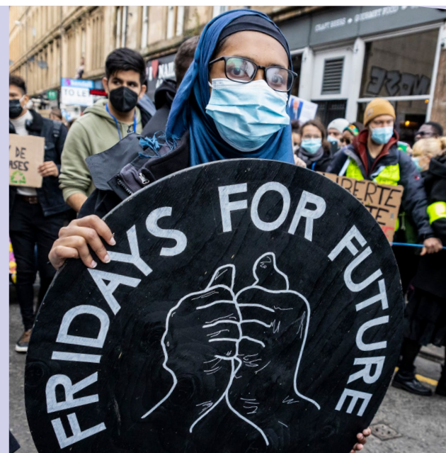
Climate Strike Glasgow on 5 November 2021