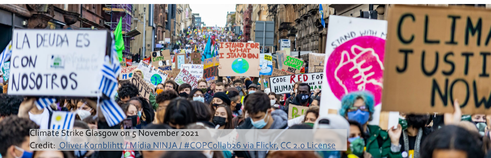
Climate Strike Glasgow on 5 November 2021