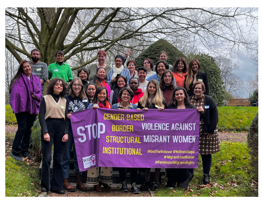
A majority of participants with an available banner from a previous action in Brussels, 21 March 2023

This report will summarize the different components of the training and how its objectives were met through the workshops, panel discussion, a tour of the European Parliament, performances, and informal exchange.