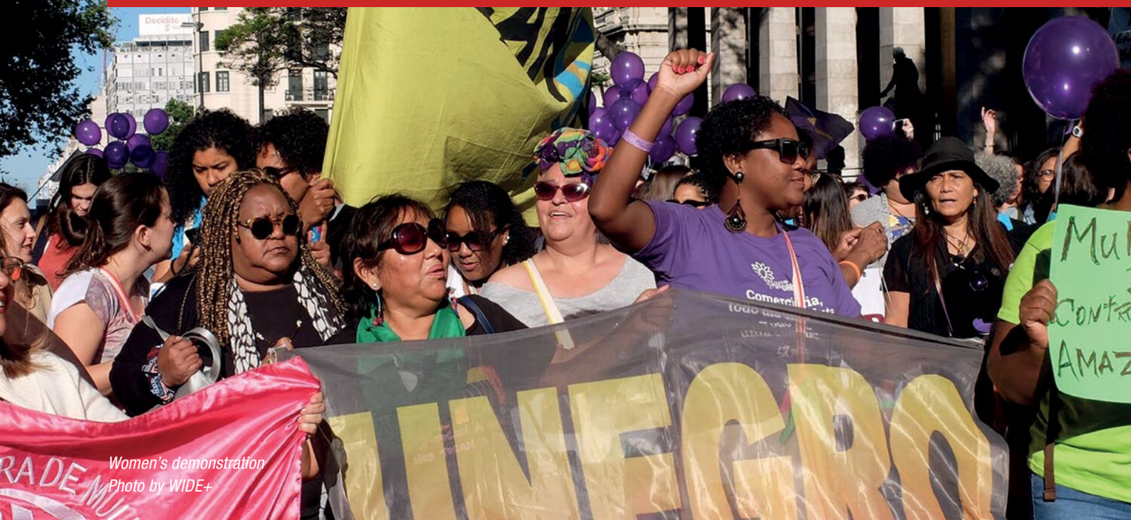
Women's demonstration

Today, European decision-makers widely acknowledge that the EU trade policy is not gender-neutral, and that this needs to be addressed. A concrete policy measure that receives a lot of attention is the integration of specific provisions – such as a dedicated chapter – on trade and gender in trade agreements. CONCORD welcomes this greater attention to the interactions between trade and women's rights and would like to contribute to ongoing debates with this submission.