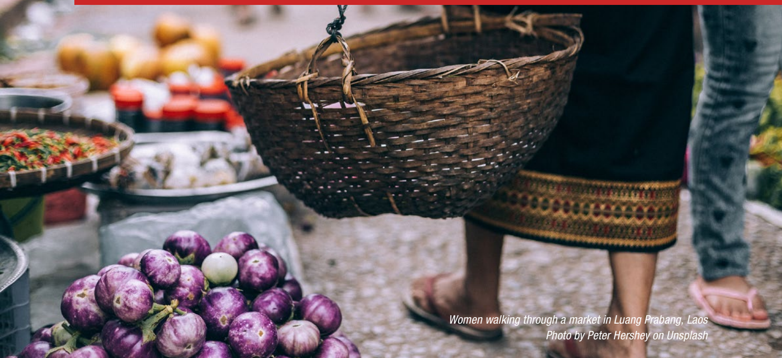
Women walking through a market in Luang Prabang, Laos

The European Commission policy paper Trade for All stresses that boosting growth is a major objective of the EU trade policy, both in Europe and in developing countries. GDP growth is in fact the overarching objective of the Juncker Commission because GDP growth is seen by European leaders as the only avenue to create jobs. The same obsession is reflected in the new Aid for Trade strategy. But producing more – which is what GDP growth measures – does not necessarily translate in improved prosperity for all, if it does not necessarily generate decent jobs for all, and it can be built on women's exploitation and the destruction of the environment. The link between growth and poverty reduction is not automatic, neither is the link between increase in exports and poverty reduction or increase. 44 In fact, this obsession with GDP growth is not commanded by the EU Treaties, which only mention growth once ("balanced growth") immediately followed by references to the importance of the social dimension and the protection of the environment. In addition, this single reference to growth in the EU Treaties concerns the internal market – not the external relations.