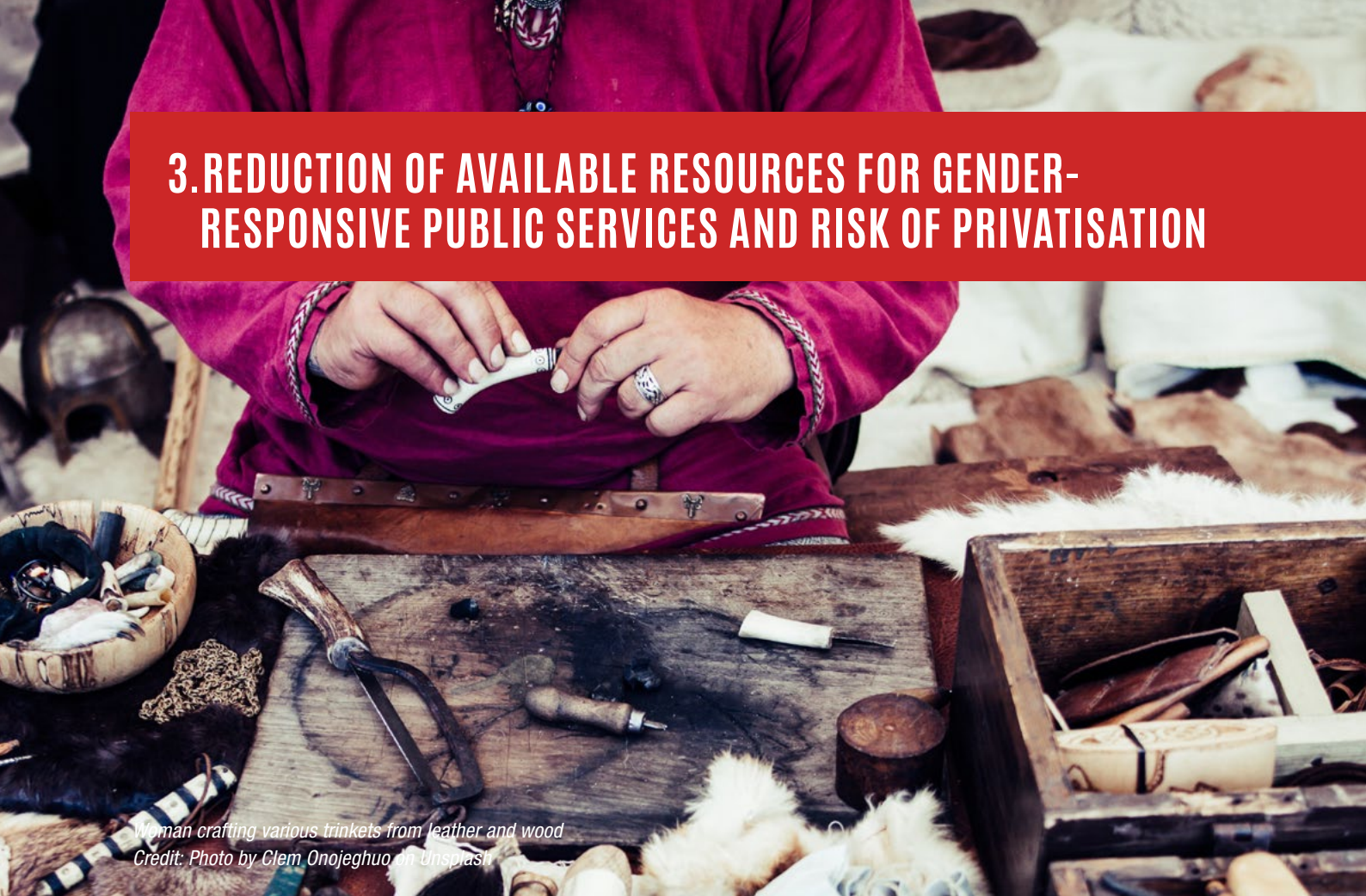
Woman crafting various trinkets from leather and wood

Trade deals impact on governments' ability to provide the public services that are vital to reduce and redistribute unpaid care work and play an equalising role in society. Unconditional access to quality gender-responsive public services and infrastructure is vital for the fulfilment of women's and girls' rights, especially women from the poorest communities. Across the globe, women undertake between two and ten times as much unpaid care than men 28 , such as caring for children, the sick and the elderly, preparing food, sourcing water and fuel, as well as other forms of domestic work. Women's time-burden of care is a major barrier to decent work, education and training opportunities, as well as women's political participation. It prevents them from enjoying the benefits of trade and investments on an equal basis with men. Where public services are missing, cut, inadequate or inaccessible, women are expected to fill the gaps. The provision of early childcare and early education, healthcare, electricity, public transport and water and sanitation are a vital means for redistributing women's care work between households and the state. Developing country governments also urgently need resources to effectively prevent and respond to the endemic levels of violence endured by women and girls. Health services, women's shelters, psychosocial support, improvements in street