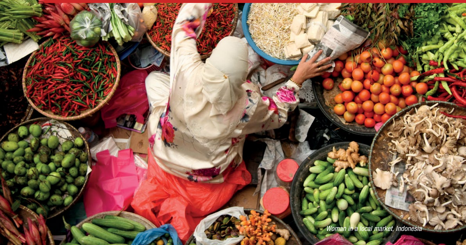
Woman in a local market, Indonesia

Insufficiently regulated trade and investment liberalisation has favoured over the last thirty years the emergence of global value chains that are built on the use of a cheap and unorganised labour workforce in the Global South. Trade agreements have allowed greater mobility of international investment, allowing companies to move to countries offering lower labour costs, including when faced with worker demands for higher wages or improved conditions. Large TNCs face serious challenges ensuring they detect, prevent and respond to rights abuses throughout their complex web-like supply chains, in line with UN Guiding Principles on Business and Human Rights (UNGPs). 5 In addition, the pressure on companies to provide a return to shareholders and the fact that competitiveness can be based on workers' exploitation hamper efforts towards sustainable and human rights compliant practices.